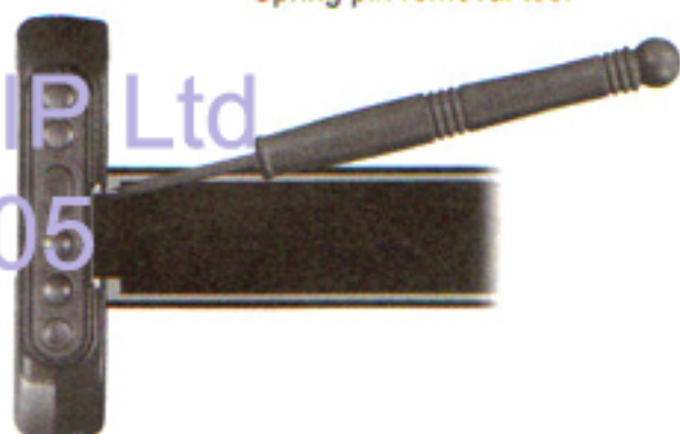
Spring pin removal tool