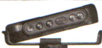
quick release bracket